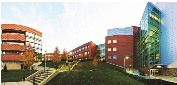
Community Partner Cincinnati State Cont. from page 1

Classes are small so that students can get the attention they need. The tuition at Cincinnati State is among the most affordable in the region, especially when you consider the high quality of the college's faculty and programs. Credits earned in many courses are transferable to any public college or university in Ohio.